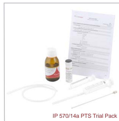
IP 570/14a PTS Trial Pack

For more information visit www.seta-analytics.com/ip-570-proficiency-testing-scheme.htm